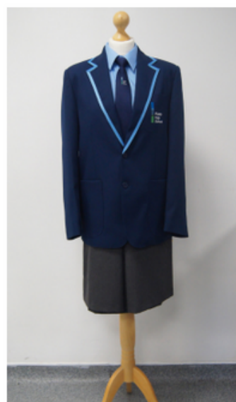
Prefect blazer and tie