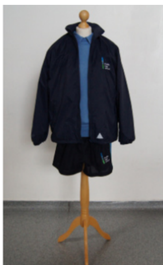
PE kit with optional jacket