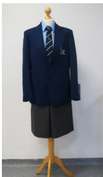
Uniform with skirt