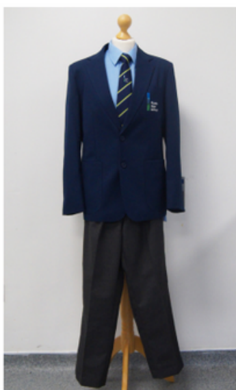
Uniform with trousers