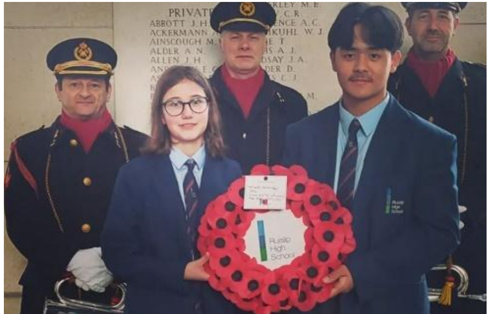
Image above: Two of our Year 9 students pay their respects on behalf of the school at Menin Gate.