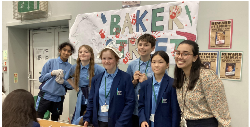
Image above: Members of 7D pose next to their murder mystery themed 'Baker Street' stall

On Wednesday 22nd March 2023, our Year 7 and 8 students hosted our annual Spring Festival, which had the theme 'London Calling.' The event, which was enjoyed by all the members of the school community, saw each tutor group prepare a stall focused on one area of London.