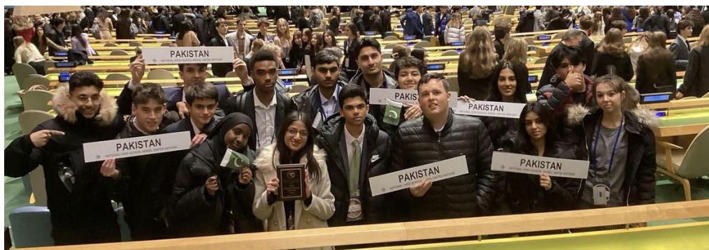
Image above: Members of Year 12 and 13, who attended the Model United Nations trip to New York City, proudly pose with their Merit Award

From Tuesday 14th March to Saturday 18th March 2023, some of our sixth form students attended the annual Model United Nations conference in New York City. This year, the students were representing Pakistan and were excited to spend the trip working with delegations from other schools around the world.