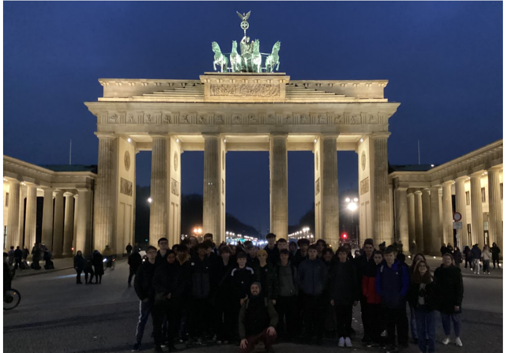
Image above: Our students and the history department next to the Brandenburg Gate

"The trip to Berlin was excellent. Every place we visited was really interesting and I feel like they were all very important to see. They really brought things I have learnt in history to life."