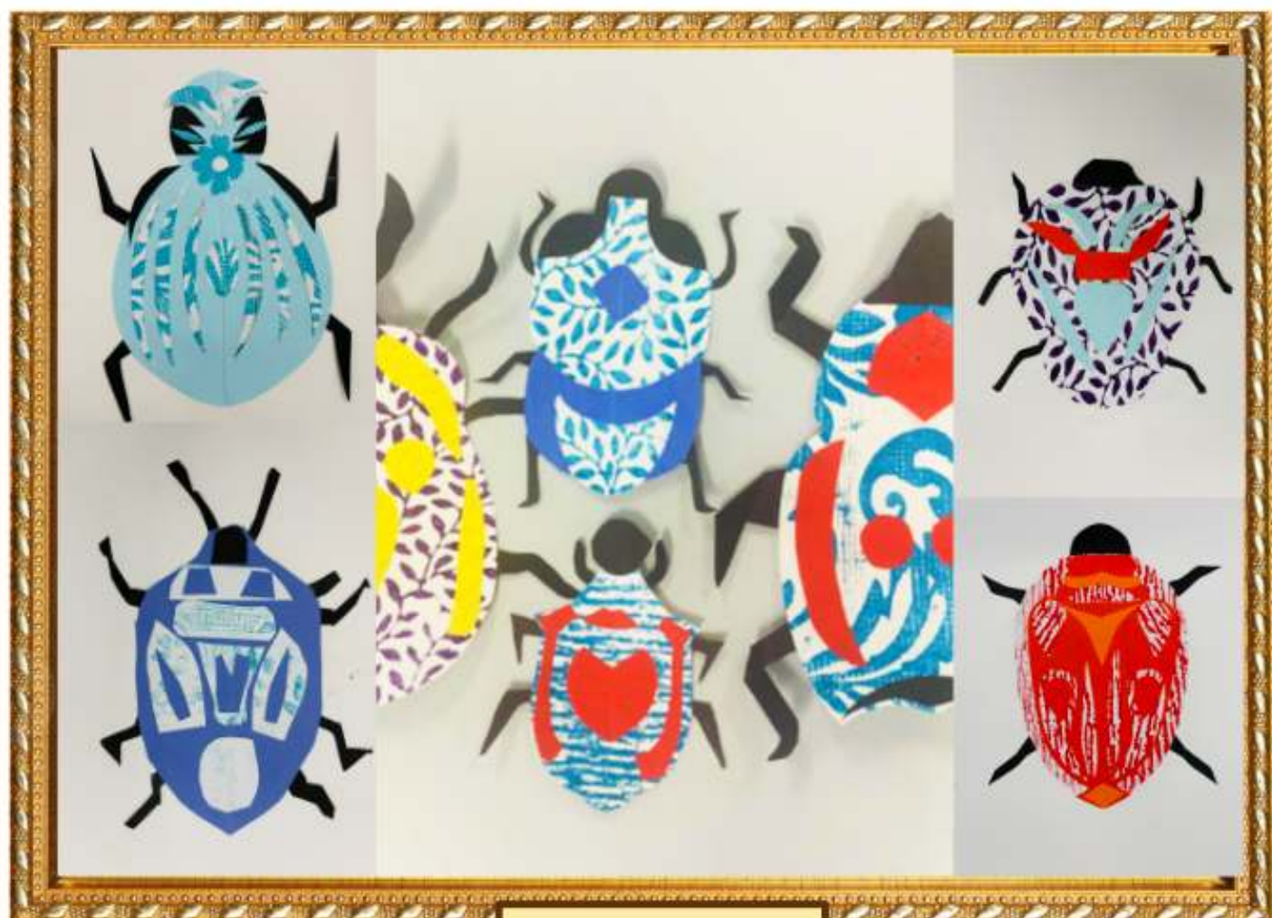
Year 9 Textiles