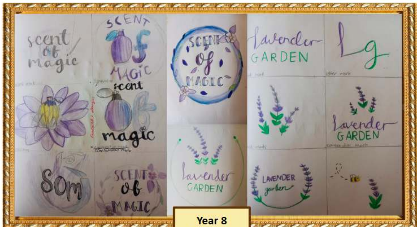
Year 8 Graphics