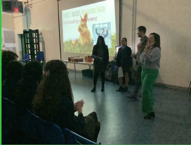
Image above: Students receive subject certificates at the Year 10 Celebration Assembly

Well done to all of the students who received an award during the spring term Celebration Assemblies.