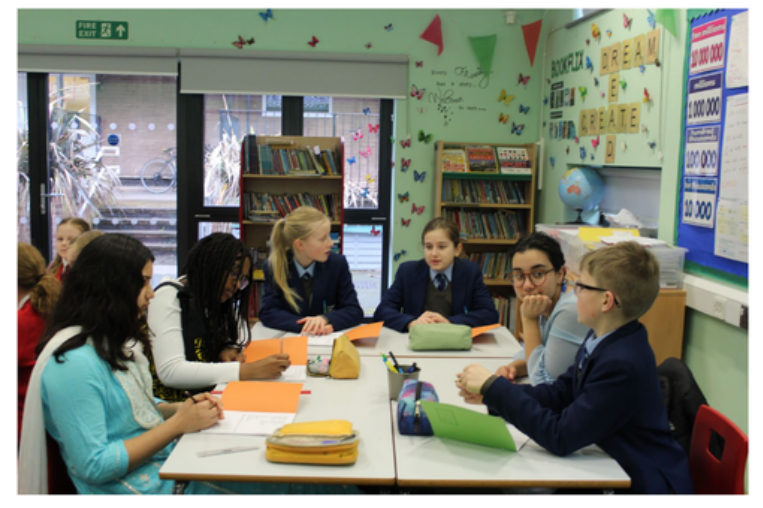
in the VLT Poetry Project at Field End Primary School

Our five students were a real credit to RHS, with their highly We look forward to our second session in March. Keep on the impressive and sophisticated interpretations of the poems, lookout for our budding poets - maybe one day they'll be Poet alongside their originality and creativity when it came to writing Laureates! their own poems.