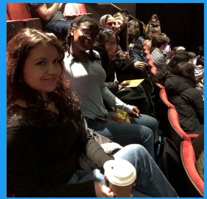
Image above: The A Level media studies students get ready to enjoy the performance of The Frogs.

Thank you to the staff who led the trip and to the students for being excellent ambassadors to the school, whilst at the performance. Year 10 will have the opportunity to visit The Kiln Theatre in April.